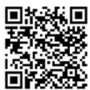
Chart of E-Filing Courts in Michigan

Request For Exemption From Use of MiFILE